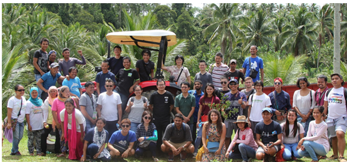
Photo: Asian Organic Youth Forum Members in Bislig, Philippines, 2018

YOGN is currently hosted by IFOAM Asia and fully sponsored by Goesan County, South Korea. For more YOGN information, visit its website at: www.yoglobalnetwork.com