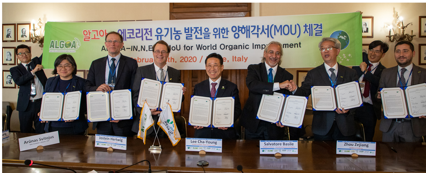
GAOD MoU Signing Ceremony in Rome together with representatives from GAOD partners

GAOD has been formed out of a union between ALGOA and INNER with the signing of a MoU in Rome, Italy, on February 6th, 2020.