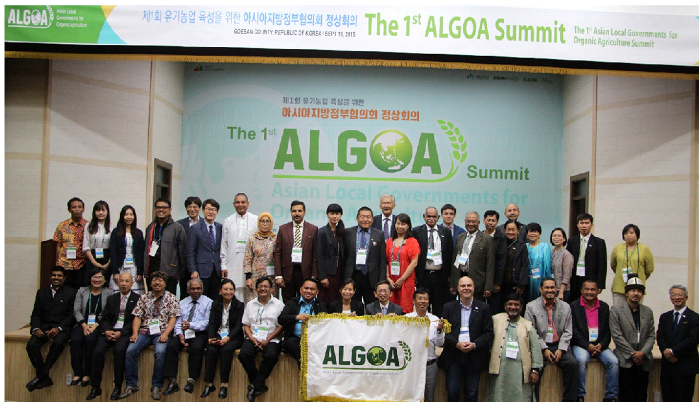
Group Photo of the Inaugural Summit of ALGOA, Sept 19th, 2015